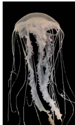
Sea nettle (left) and its favorite prey, comb jelly

The researchers recently published a study in Estuaries and Coasts revealing a strong correlation between declining oyster populations, a reduction in the abundance of sea nettles, and a subsequent increase in sea nettle's